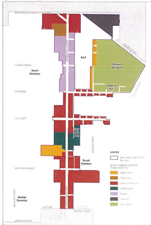
Figure XX: North Harbor Specific Plan Districts